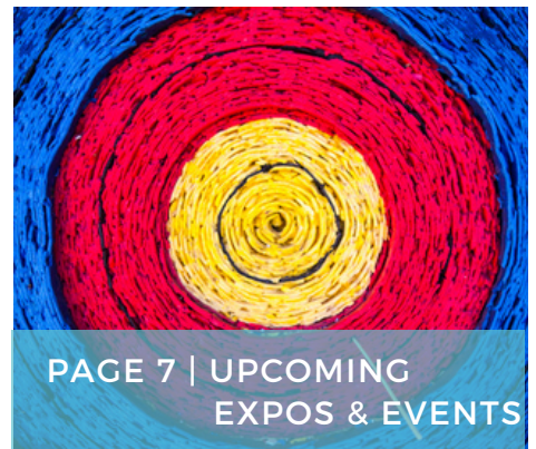
PAGE 7 | UPCOMING EXPOS & EVENTS