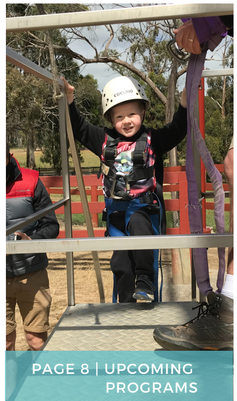
PAGE 8 | UPCOMING PROGRAMS