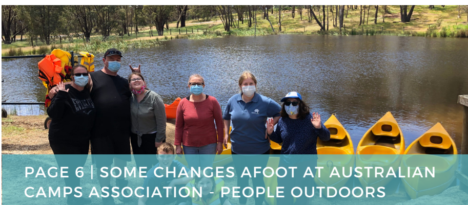
PAGE 6 | SOME CHANGES AFOOT AT AUSTRALIAN CAMPS ASSOCIATION - PEOPLE OUTDOORS