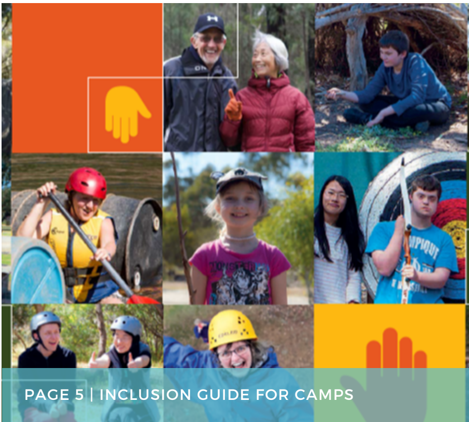
PAGE 5 | INCLUSION GUIDE FOR CAMPS